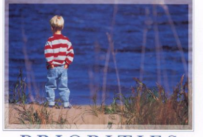
A HUNDRED YEARS FROM NOW IT WILL NOT MATTER WHAT MY BANK ACCOUNT WAS, THE SORT OF HOUSE I LUYD IN, OR THE KIND OF CAR I DROVE, BET THE WORLD MAY BE DIFFERENT REGARD. WAS INFORMERY IN THE HER OF A CULIN.